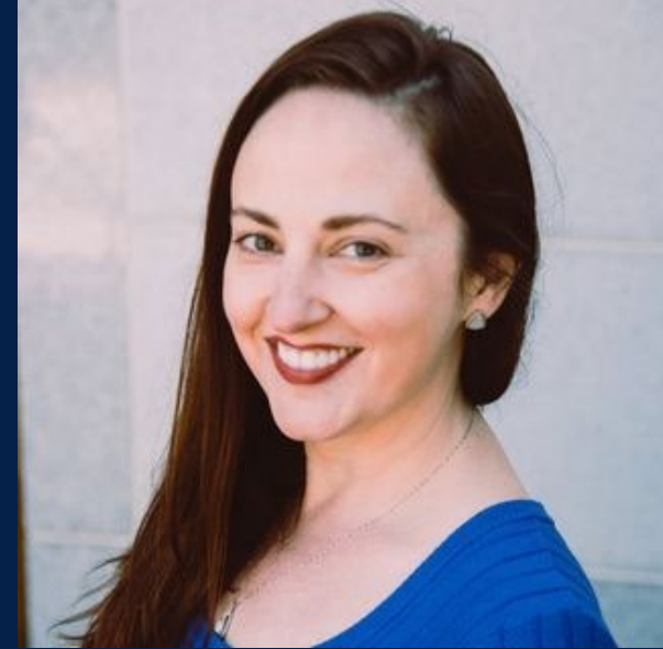
Medical Education Program Administrator MB/MZ Site Coordinator