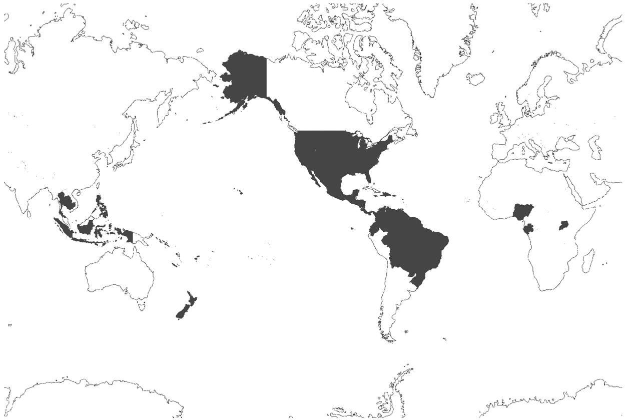
Figure 2. All countries and regions reporting laboratory-confirmed autochthonous Zika virus cases, January 1, 2015–February 10, 2016 (online Technical Appendix Table 2, http://wwwnc.cdc.gov/EID/article/22/7/15-1990-Techapp1.pdf ). Data represent outbreaks and case reports for all reported autochthonous laboratory-confirmed cases of Zika virus infection, including those reported in the peer-reviewed literature; public health agency Web sites, bulletins, and broadcasts; and media reports for selected dates.

Ae. aegypti mosquitoes, which laboratory experiments have shown to be capable of transmitting Zika virus (26,27). Ae. hensilli mosquitoes were implicated in the Yap outbreak, yet Zika virus has never been isolated from these mosquitoes (28,29). In Africa, the predominant Aedes species vector has not been definitively identified, although viral isolation studies suggest that Ae. albopictus was the likely vector in a 2007 Zika virus outbreak in Gabon (23).